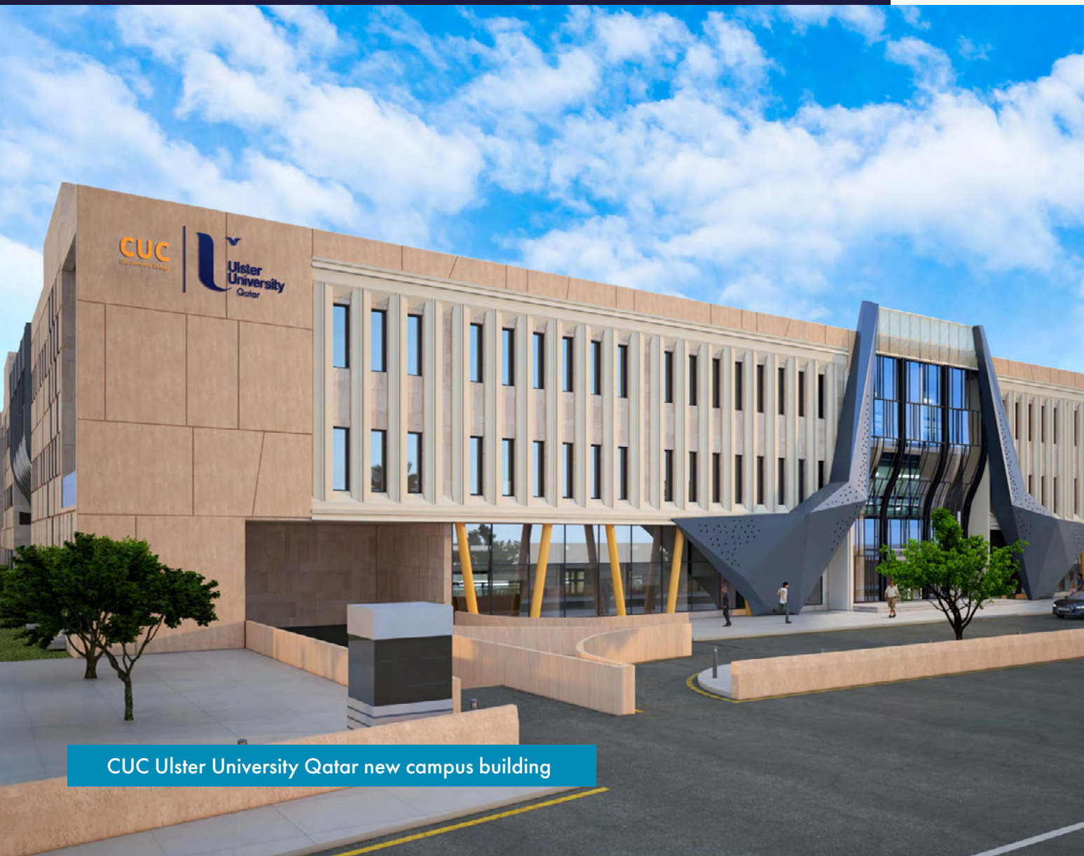
CUC Ulster University Qatar new campus building

CUC Ulster is a modern and dynamic higher education institution based in Qatar who, in partnership with Ulster University offers recognised UK diplomas, undergraduate and postgraduate degrees that are licensed by the Ministry of Education and Higher Education, Qatar. Through its Applied Learning and University pathways, CUC Ulster offers alternative routes to university and work for students from across the globe.